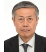
Hon. Yoshiaki Miawa Consul General of Japanese Consulate Office in Davao City