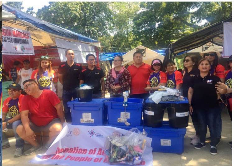
ROTARIANS IN ACTION - DOING GOOD IN THE WORLD...